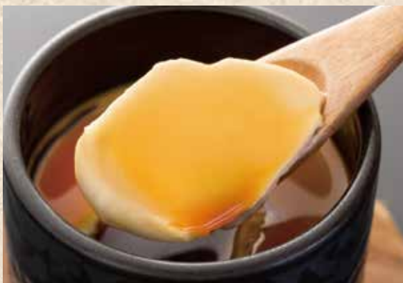
Hanami Egg Crème Brûlée 450yen

The handmade creamy pudding was made with luxurious original brand Hanami Eggs with a melt-in-your-mouth texture and rich flavor.