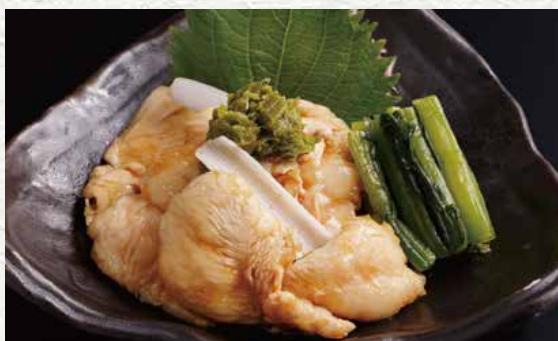
Hanamidori white meat with wasabi