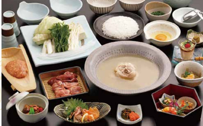
A picture is an image picture of "Hana course"