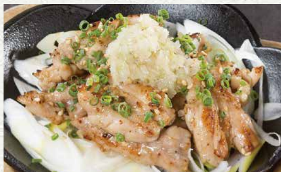
Teppanyaki Boneless Chicken Neck Meat with Onion and Salt 880yen

The white meat taste good and soft with special soy sauce and wasabi with full of flavor. Nozawana is accent by side.