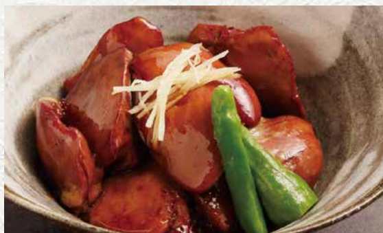
Salty-sweet fresh chicken liver 750yen

Gizzards that are so fresh that it could even be eaten as sashimi. The garlic taste is guaranteed to stimulate your appetite.