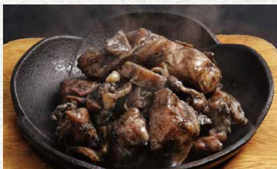
Grilled a full grown chicken thigh

Mix the chicken neck meat with the homemade onion salt and grill.