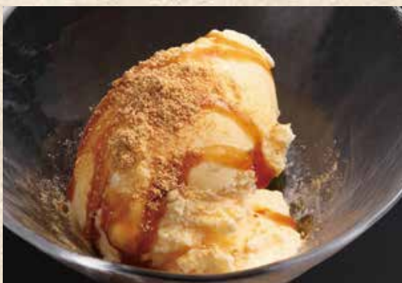
Hanami Egg Ice Cream 430yen

The handmade creamy pudding was made with luxurious original brand Hanami Eggs with a melt-in-your-mouth texture and rich flavor.