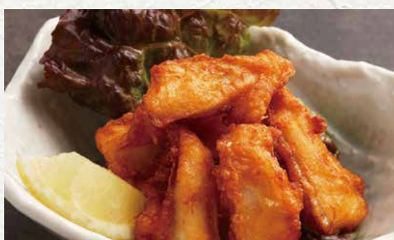
Fried Nankotsu Chicken Soft Bone 750yen

Fresh chicken liver topped with a delicious salty-sweet taste.