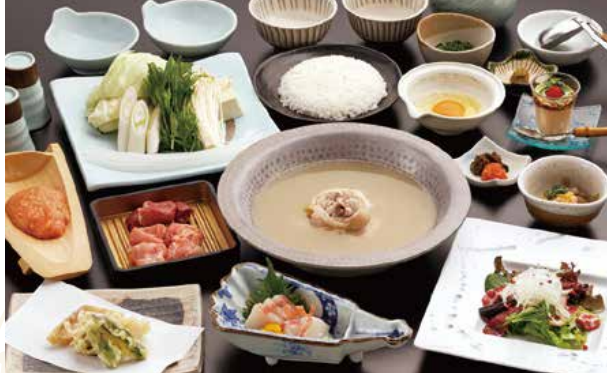
A picture is an image picture of "Hou-oh course"