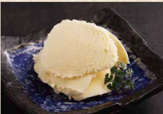
Vanilla ice cream 390 yen

The handmade creamy pudding was made with luxurious original brand Hanami Eggs with a melt-in-your-mouth texture and rich flavor.