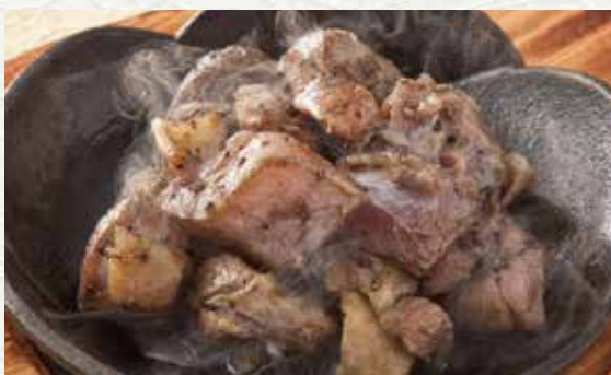
Roasted Hanamidori chicken thighs 980yen

Mix the chicken neck meat with the homemade onion salt and grill.