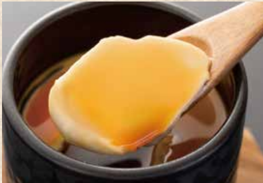
Hanami Egg Crème Brûlée 450 yen

The handmade creamy pudding was made with luxurious original brand Hanami Eggs with a melt-in-your-mouth texture and rich flavor.