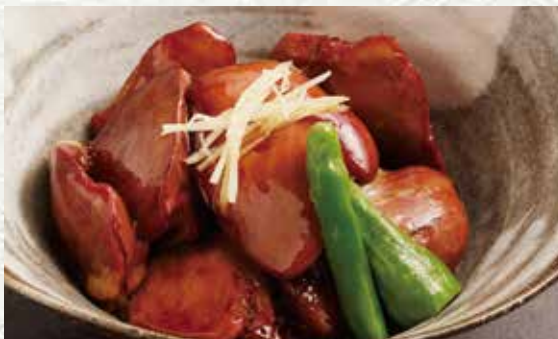
Salty-sweet fresh chicken liver 670yen

Gizzards that are so fresh that it could even be eaten as sashimi. The garlic taste is guaranteed to stimulate your appetite.