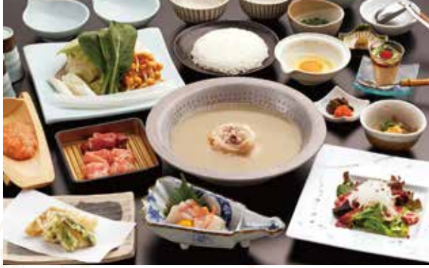
A picture is an image picture of "Hou-oh course"