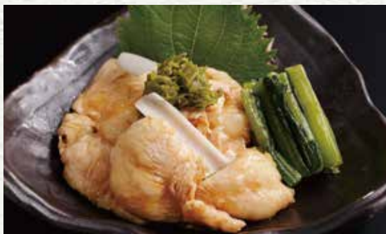
Hanamidori white meat with wasabi 580yen

The white meat taste good and soft with special soy sauce and wasabi with full of flavor. Nozawana is accent by side.