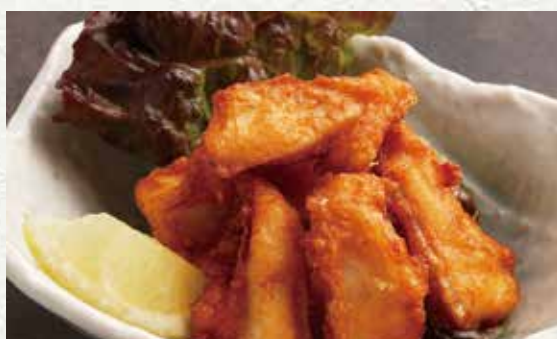
Rare deep fried chicken cartilage 750yen

Fresh chicken liver topped with a delicious salty-sweet taste.