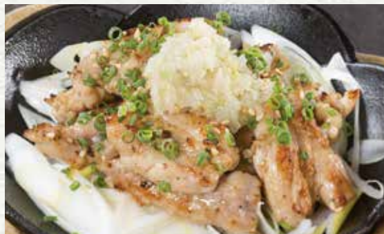
Teppanyaki Boneless Chicken Neck Meat with Onion and Salt 880yen

The white meat taste good and soft with special soy sauce and wasabi with full of flavor. Nozawana is accent by side.