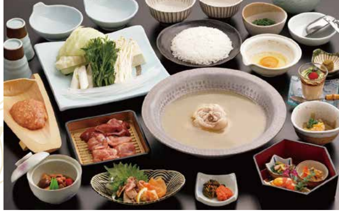
A picture is an image picture of "Hana course"