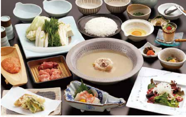
A picture is an image picture of "Hou-oh course"