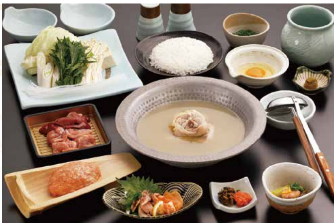
A picture is an image picture of "Aji course"