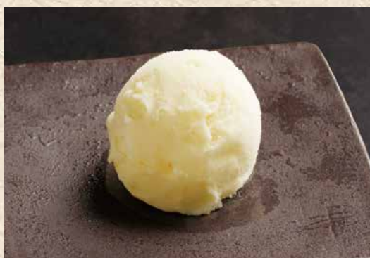
Yuzu Sorbet (including fruit pulp) 380yen

You can choose with or without Kuromitsu Kinako.