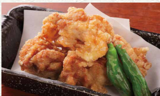
Mizutaki fried chicken 750yen

Crispy fried cartilage with a delightful crunch. Enjoy the unique texture and savory flavor of the cartilage.