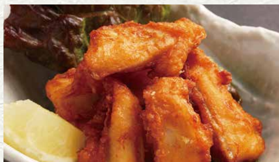
Fried Nankotsu Chicken Soft Bone 650yen

Grilled a full grown domestic chicken boldly. Hope you enjoy the unique chewy and taste.