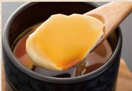
Hanami Egg Crème Brûlée 400yen

The handmade creamy pudding was made with luxurious original brand Hanami Eggs with a melt-in-your-mouth texture and rich flavor.