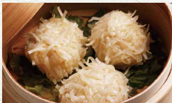
Hanamidori tofu dumpling 580yen

Marinated in our special sauce that's created from a combination using the soup of chicken stew along with Japanese ponzu and yuzu pepper.